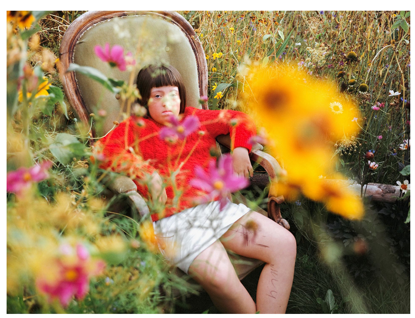
From 'The Garden' by Siân Davey